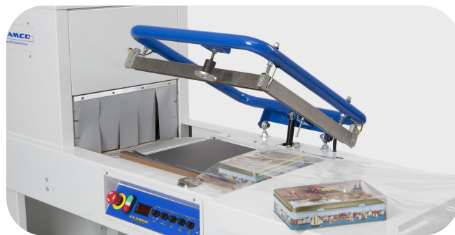
The Clamco Combo semi-automatic shrink packaging system includes many standard features combined with its comparatively lower price makes it the best value in its category