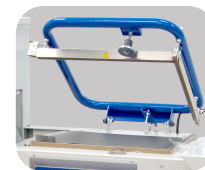
Magnetic hold-down feature