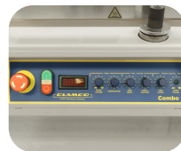
User friendly setup